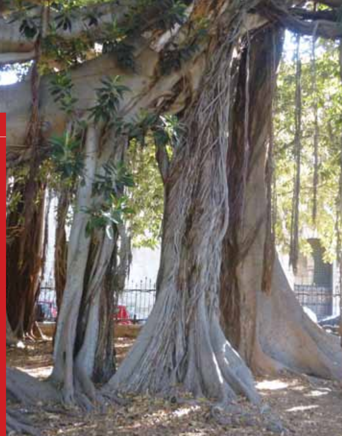
Left to right from top: Palermo cathedral; incredible Banyan trees; Teatro Massimo, Palermo; view out towards the hills; mosaics outside at Monreale; the orto botanic building and entrance; marzipan fruit

AI LUMI Corso Vittorio Emanuele 75, Trapani ☎ +39 0923 540 922 www.ailumi.it info@ailumi.it A friendly atmospheric bed and breakfast on the main street of the historical part of Trapani. It has a beautiful courtyard and a restaurant next door which serves delicious local dishes. You can get 15 per cent discount at the restaurant (located right next door) when booking a room. Double room from €100